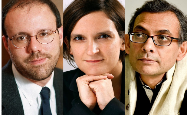
Michael Kremer Esther Duflo Abhijit Banerjee

The new Nobel laureates helped to bring scientific rigor and real-world impact to development economics.